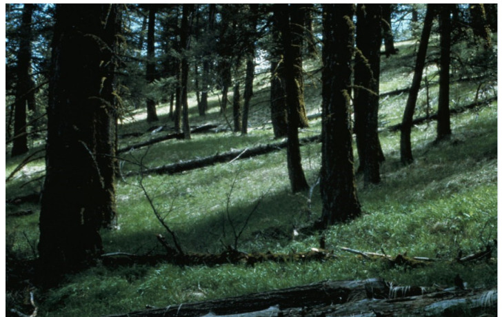
Rocky Mountain Douglas-fir ( Pseudotsuga menziesii var. glauca ) stand with open understorey dominated by pine reedgrass ( Calamagrostis rubescens ). Southcentral British Columbia.