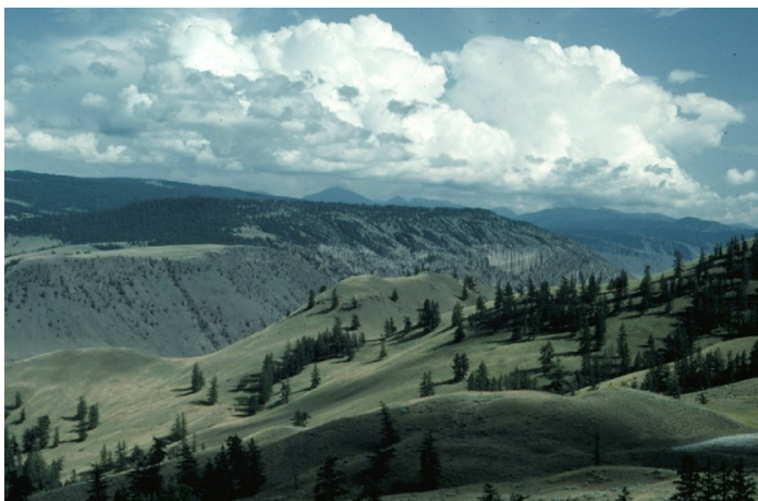
Parkland landscape comprising woodland and forest stands of Rocky Mountain Douglas-fir ( Pseudotsuga menziesii var. glauca ) in association with grassland areas characterized by bluebunch wheatgrass ( Pseudoroegneria spicata ). Southcentral British Columbia.

In Canada, M501 occurs in a dry, continental temperate climate with warm summers and cool winters. Mean annual temperature varies from 2° to 9°C, and precipitation typically varies from 350 to 600 mm. Elevations seldom exceed 1400 mASL, and can be as low as 150 mASL. All parts of the range experienced Pleistocene glaciation; soils are mostly Luvisols, Brunisols and, in Alberta, Chernozems, developed in glacial surficial materials. A surface layer of volcanic ash occurs in some areas. Two subtypes distinguish regional variation in the Canadian range of M501: CM501a [Warm Dry Rocky Mountain Low Montane Forest] describes Ponderosa pine – Douglas-fir forests and woodlands in the driest valleys and plateaux of southern BC, and CM501b [Cool Dry Rocky Mountain Low Montane Forest] characterizes forests and woodlands of higher elevations in BC as well as the parkland areas of the Rocky Mountain foothills in southwestern Alberta.