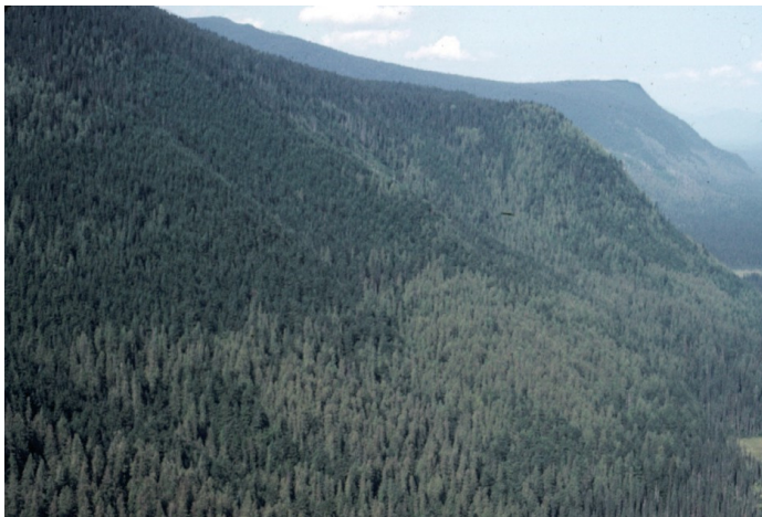
Toposequence of western hemlock ( Tsuga heterophylla ) and western red cedar ( Thuja plicata ) forests near Prince George, BC. Hemlock dominates the drier upper slopes and cedar the moister lower positions.

In Canada, M500 occurs within a continental temperate climate with warm summers, cool winters and high annual precipitation. These forests grow best on well to imperfectly drained sites with high soil moisture. Mean annual precipitation is highly variable throughout the Canadian range, typically 700 to 1400 mm on average. Where precipitation is lower, sites rely on moisture inputs from snowmelt and stands often occur on lower/toe slopes or on cool aspects. Mean annual temperatures vary from approximately 2.5° to 8° C, depending on latitude and elevation; soils typically don't freeze in the winter. M500 forests occupy the low to mid-elevations (up to approximately 1500 mASL) in mountains and highlands in southeastern and northwestern BC, wherever precipitation levels are sufficient. All parts of the range experienced Pleistocene glaciation; soils are mostly Podzols, Luvisols and Brunisols developed in glacial surficial materials. Three subtypes characterize regional variation in the Canadian range of M500: CM500a [Southern Mesic Rocky Mountain Low Montane Forest] describes forests in southeastern BC near the international border; CM500b [Typic Mesic Rocky Mountain Low Montane Forest] is the typical condition for the main portion of the Canadian range in southeastern BC; CM500c [Northern Mesic Rocky Mountain Low Montane Forest] describes forests in northwestern BC in the lee of the Coast Mountains.