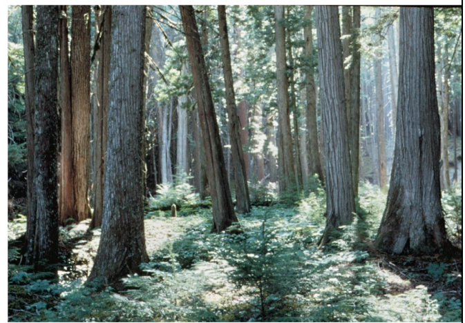
Western red cedar ( Thuja plicata ) dominated stand with an open understory in southeastern BC.