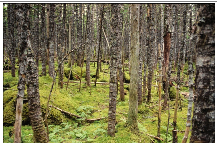
Balsam fir ( Abies balsamea ) stand with an open understory characterized by a carpet of feathermosses in western Newfoundland.