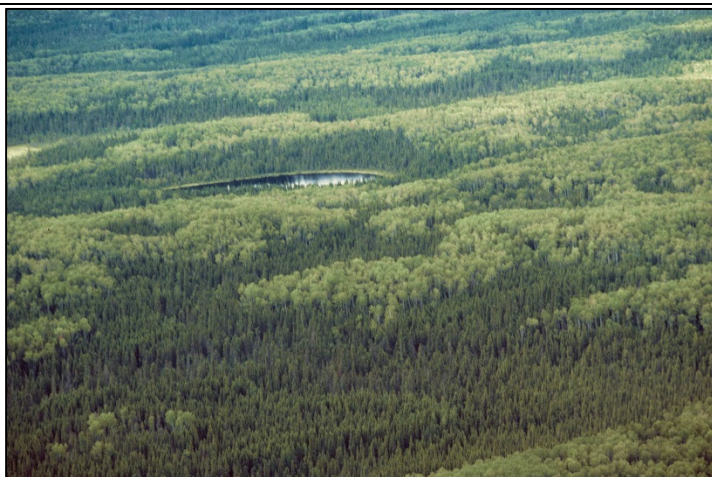
Trembling aspen ( Populus tremuloides ) and black spruce ( Picea mariana ) dominated stands on low relief Precambrian Shield terrain in north-central Ontario. Aspen is on the upper slopes while black spruce occupies the lower slopes and landscape depressions.

Two subtypes distinguish boreal forests characteristic of maritime climatic influences (CM495a [Atlantic Boreal Forest]) from forests characteristic of shorter fire cycles in a more continental climate (CM495b [Ontario – Quebec Boreal Forest]).