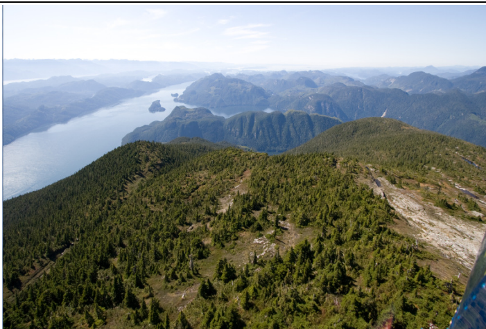
Mountain hemlock ( Tsuga mertensiana ) dominated forests and woodlands on the central coast of British Columbia (Great Bear Rainforest). Note open stand structure and patchy distribution on shallow, exposed sites.

Two subtypes characterize regional variation in the Canadian range of M025. CM025a [Typic Vancouverian High Montane & Subalpine Forest] is the predominant condition occurring on most of the Vancouver Island and mainland ranges. CM025b [Hypermaritime Vancouverian High Montane & Subalpine Forest] describes the high elevation forests and woodlands in hypermaritime climates on Haida Gwaii and the outer coast of mainland BC.