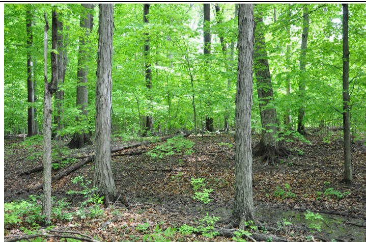
Stand dominated by shagbark hickory ( Carya ovata ), northern red oak ( Quercus rubra ) and sugar maple ( Acer saccharum ). Bronte Creek Provincial Park, Ontario.