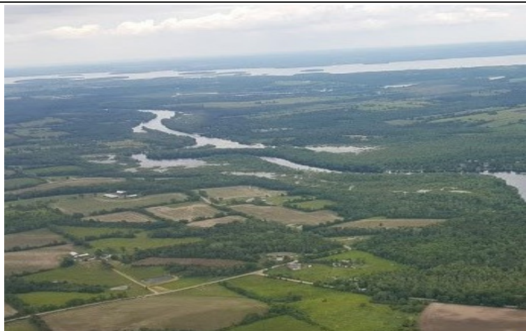
Forest patches dominated by sugar maple ( Acer saccharum ) in a fragmented southern Ontario landscape. Near Rice Lake, Ontario.

CM742 occurs in the humid, continental cool temperate climate of eastern Canada, generally characterized by cool winters and moist, warm to hot summers. Mean annual temperatures vary from 5°C to >9°C. Mean annual precipitation is >900 mm throughout the range; rainfall significantly exceeds snowfall. Regional geologic and topographic features of the St. Lawrence Lowlands physiographic region produce a mostly subdued topography with low relief, except in the west-central part of the range where the cliffs of the Niagara Escarpment overlook the plains. All parts of the region experienced late Pleistocene glaciation; soils are mostly calcareous Luvisols and Brunisols developed in glacial surficial materials. Two subtypes distinguish regional variation within this Macrogroup. Subtype CM742a [Warm Eastern Canadian Temperate Deciduous Forest] describes forests of warmer sites, mostly near Lake Erie, that are dominated by sugar maple with a floristic assemblage that reflects deciduous forests south of the Great Lakes. CM742b [Cool Eastern Canadian Temperate Deciduous Forest] describes maple-beech-basswood dominated forests that have greater conifer content and occur from Lake Huron eastward into the St. Lawrence valley of southwestern Quebec.